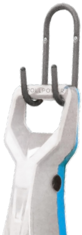
Wall support (included in the price)

ROLLPOWER This motorisation fits for most bar covers on the market